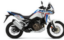
Africa Twin DCT