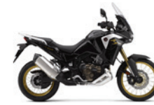
Africa Twin Adventure Sports ES