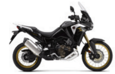
Africa Twin Adventure Sports ES DCT